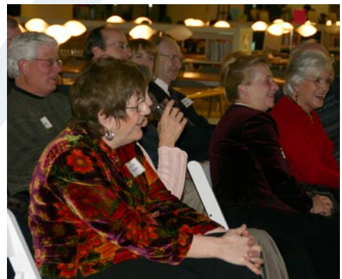
Attendees take in the traditions of a Della Robbia holiday